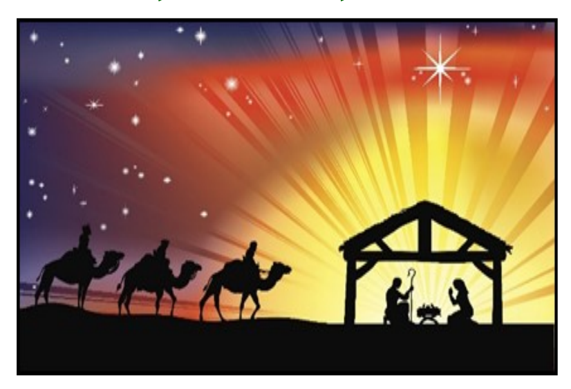
Join us as our youth retell the story of Jesus' Birth!